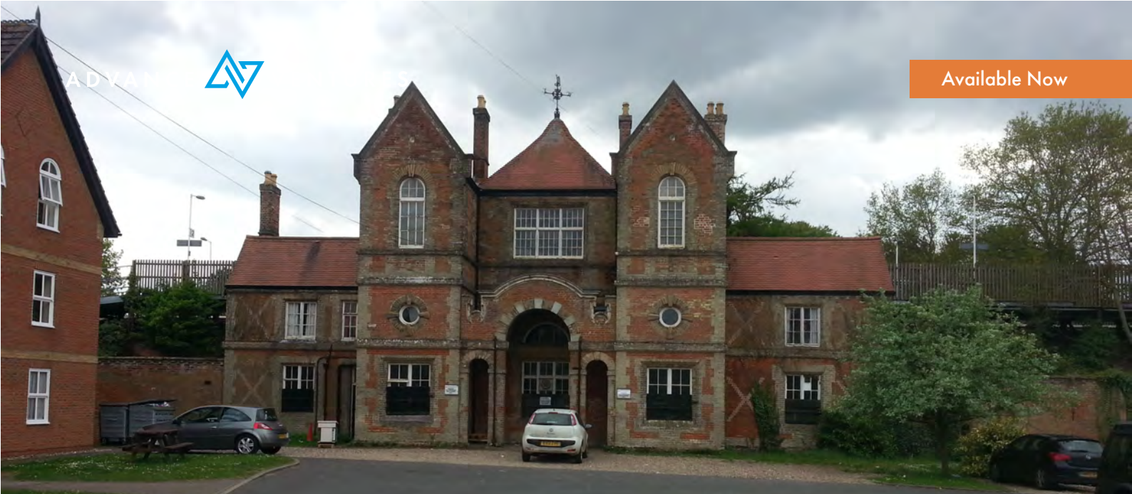
Station Building - Thurston Station