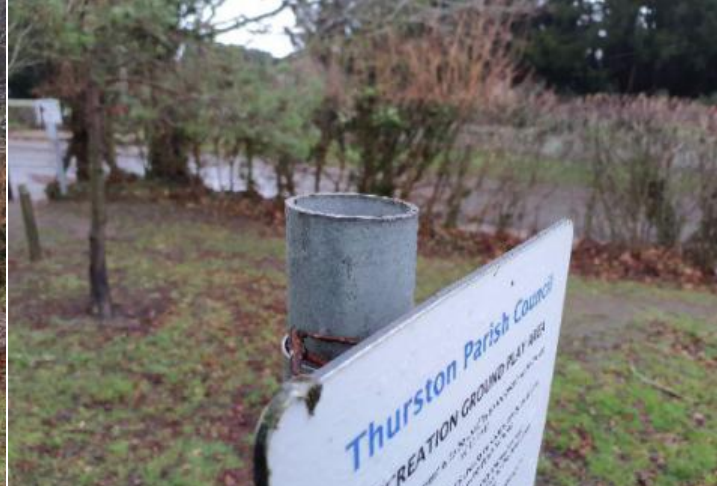
Finding: There are post / end caps missing from the item