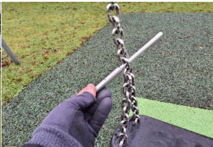
Finding: The chain openings are in excess of 8.6mm and do not meet the recommendations of BS EN 1176 Part 1