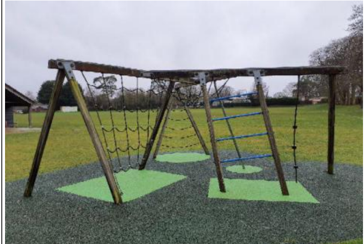
Finding: There is/are bolt cap covers missing or damaged on the item

Item:Activity Equipment - Climbing FrameRisk Level:V - Very Low RiskManufacturer:Kompan LtdSurface:Bonded Rubber Mulch