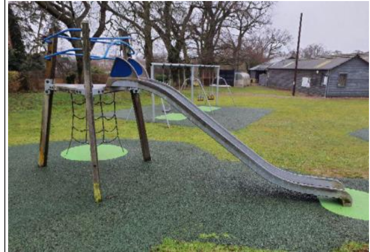
Finding: There is algae or moss on the surface of the equipment

Manufacturer: Kompan Ltd Surface: Bonded Rubber Mulch