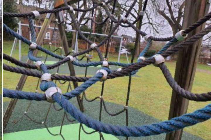
Finding: The ropes/nets are worn/damaged in places