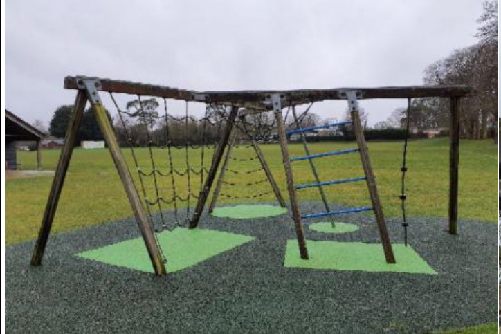
Finding: There is algae or moss on the surface of the equipment

Manufacturer: Kompan Ltd Surface: Bonded Rubber Mulch