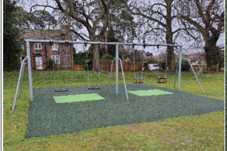
Finding: The seat clearance from finished surface level to the underside of the seat is too low and does not meet the requirements of BS EN 1176 Part 2 (350mm minimum clearance required)

Manufacturer: Kompan Ltd Surface: Bonded Rubber Mulch