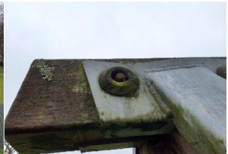
Action: Replace missing or damaged bolt cap covers