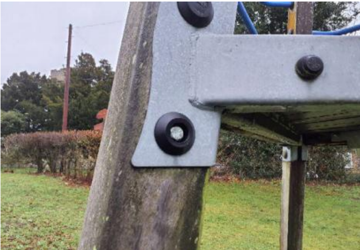
Action: Replace missing or damaged bolt cap covers