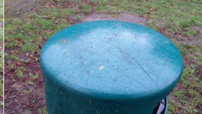
Finding: There is some damage to the item