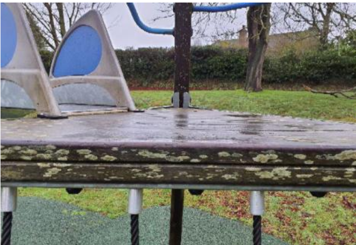
Action: Clean and treat appropriately