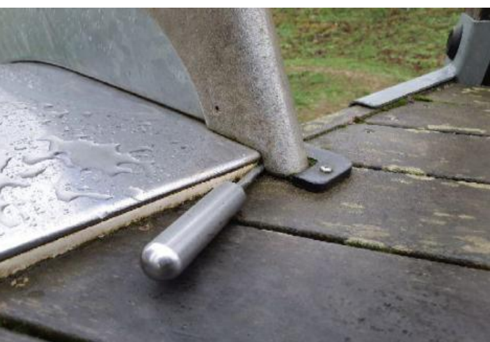
Action: Monitor - No remedial work recommended