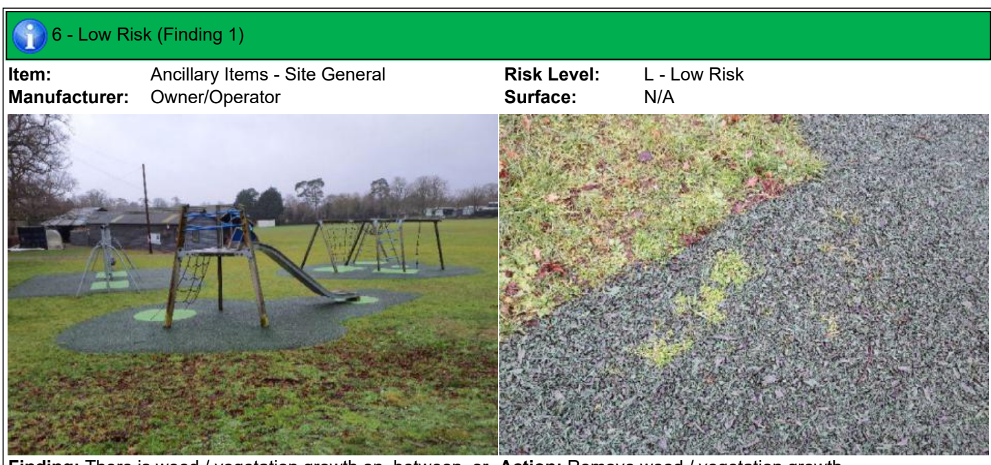
Finding: There is weed / vegetation growth on, between, or Action: Remove weed / vegetation growth around the edges of the surfacing