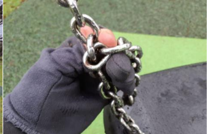
Finding: There is some notable evidence of chain wear