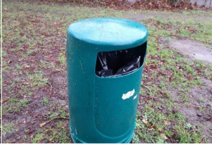
Finding: The lid or door of the litter bin is not secured

Action: Ensure the lid or door is kept locked