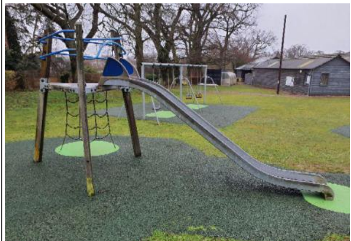
Finding: There is/are bolt cap covers missing or damaged on the item

Item:Activity Equipment - Multi Play (Junior)Risk Level:V - Very Low RiskManufacturer:Kompan LtdSurface:Bonded Rubber Mulch