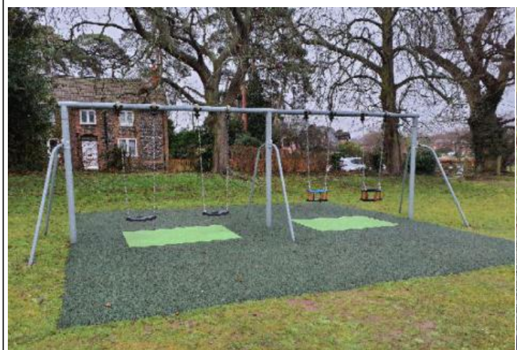
Finding: The connecting links are in excess of 8.6mm and less than 12mm and fail the requirements of BS EN 1176 Part 1; clause 4.2.13, Chains

Item:Swings - 2 Bay (2 Flat, 2 Cradle)Risk Level:V - Very Low RiskManufacturer:Kompan LtdSurface:Bonded Rubber Mulch