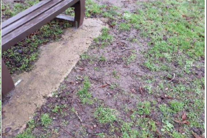
Finding: The surface has eroded in some areas and may be Action: Reinstate the surface slippery in wet conditions