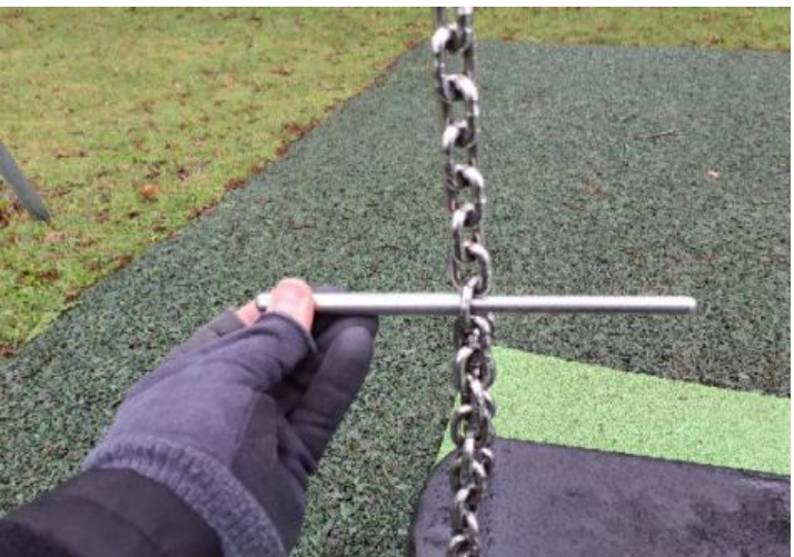
Action: Monitor use and replace with compliant links at the next maintenance cycle