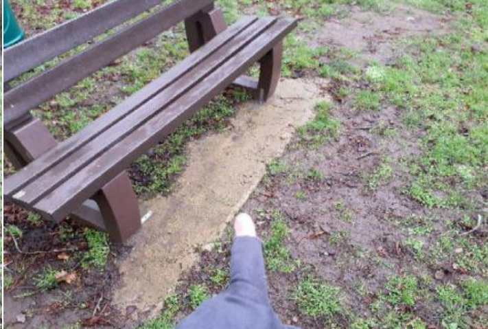
Finding: There are trip hazards at the edges of the surface