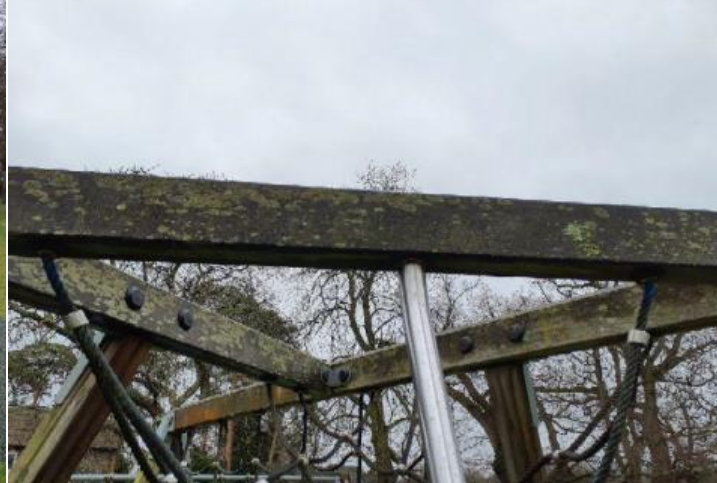
Action: Clean and treat appropriately