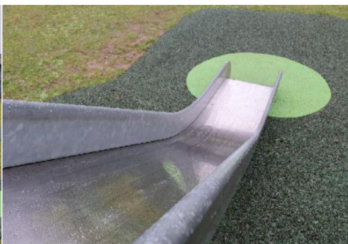
Action: Monitor for any further deterioration and repair as required